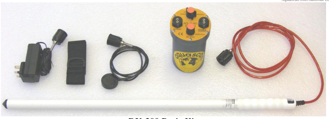
DX-300 Basic Kit

The Aquascan DX-300 Diver Held Magnetometer is a precision built instrument using the latest Fluxgate magnetic sensors, and has been designed for both ease and simplicity of use in the underwater environment, featuring four sensitivity settings for use in pinpointing targets. The initial design featured LO, MED & HI settings; however since introducing the DX-300 an X HI range has been added.