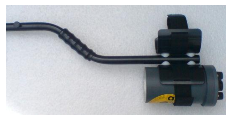
DX-300 Control Unit mounted in optional Armsaver

Optional DX-300 Armsaver – probe retracted