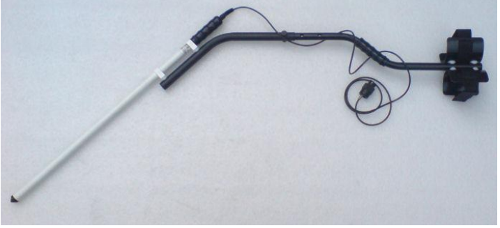
Optional DX-300 Armsaver – probe extended